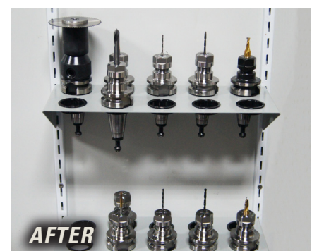
Tool clutter eliminated and productivity increased when using these shelves.